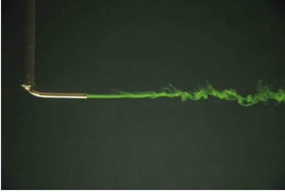
Figure 1. Short captions are centered.